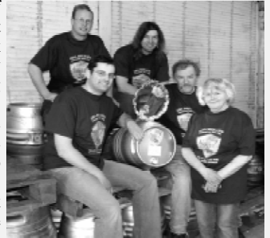
The Castle Rock team with the SIBA award

pints of Harvest Pale a week from its new brewing plant. Plans are in place to increase this up to 15,000 pints per week over the next twelve months.