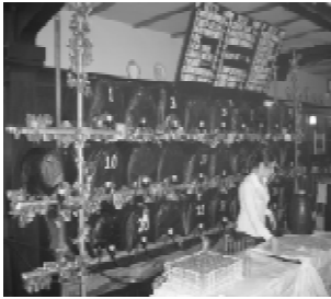
Beers from the cask at the Bell

For further information please contact the pubs direct, Ye Olde Trip To Jerusalem (0115) 9473171, the Bell Inn (0115) 9475241. Site and Cellar tours can be arranged in both venues on request.