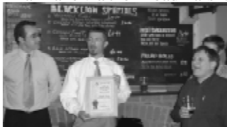
The Black Lion receives a Pub of Excellence award

The pub, on Main Road, is easily reached by public transport. Trains run to Radcliffe from Nottingham. Trent Barton's Rushcliffe Lines 2 and 3 run to the village from Friar Lane via the Broadmarsh.